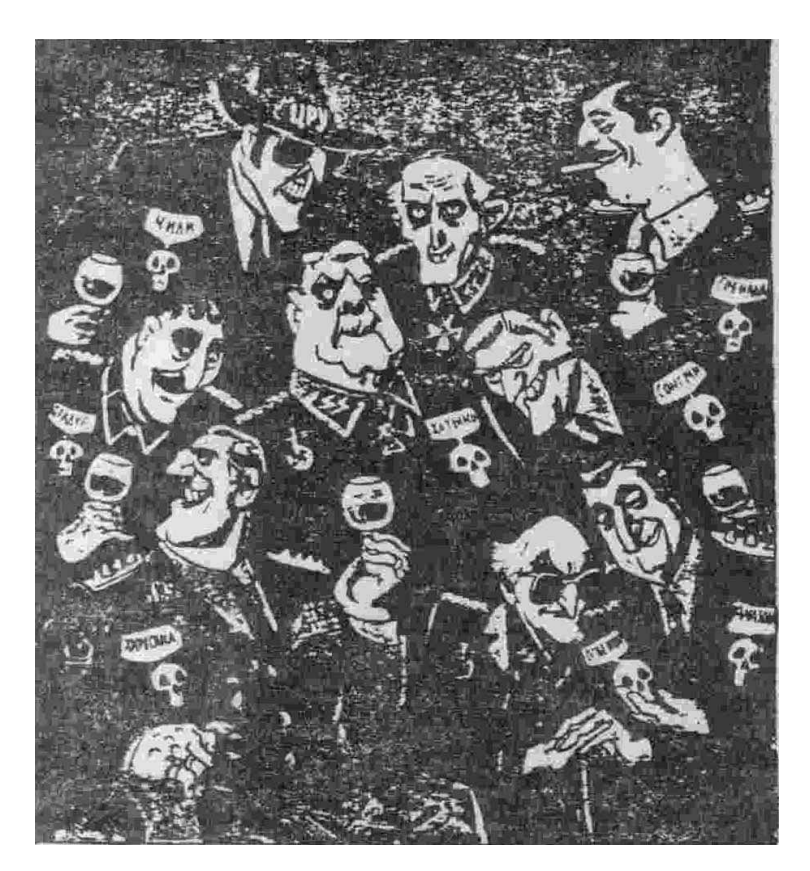
Figure 2. "Here's to our mutual understanding and cooperation, colleagues!"