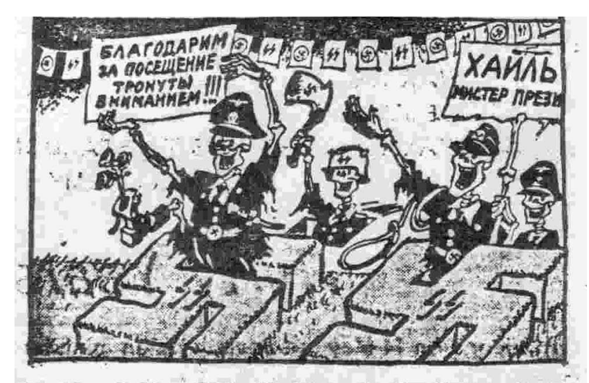
Izvestiya, 6 May 1985: "Rejoicing in the Cemetery". The resurrected SS men hold placards proclaiming: "We thank you for your visit and are touched by your attention!!!" and "Heil, Mr President!"