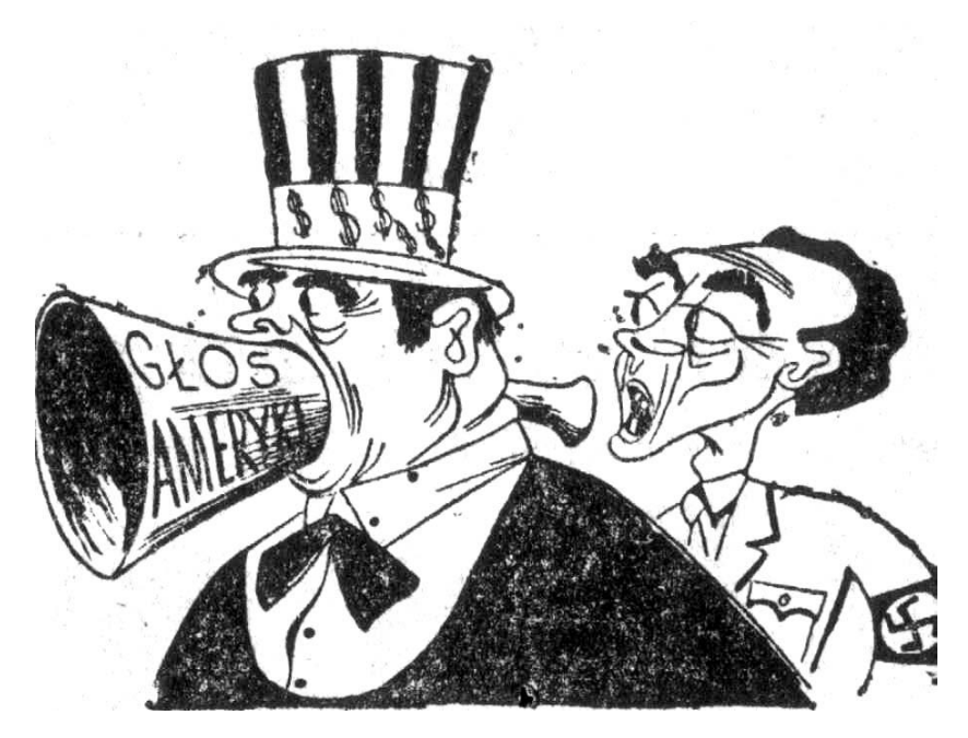
Figure 1. The inscription on the loudspeaker reads "Voice of America"